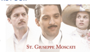
ST. GIUSEPPE MOSCATI

Giuseppe Moscati, "the holy physician of Naples," as a medical doctor and layman in the early twentieth century who came from an aristocratic family and devoted his medical career to serving the poor. His research also led to the discovery of insulin as a cure for diabetes. Moscati regarded his medical practice as a lay apostolate, a ministry to his suffering fellowmen. Before examining a patient or engaging in research, he would place himself in the presence of God. He encouraged his patients to receive the sacraments.